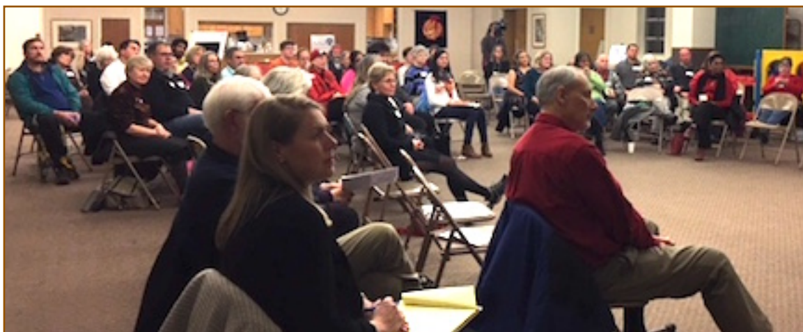
Attendees at Salem Speaks Up!