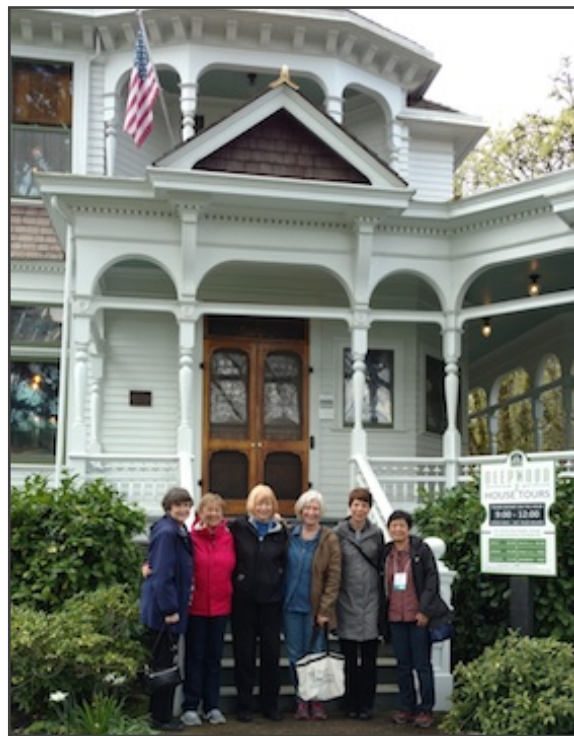
Deepwood tour ↑