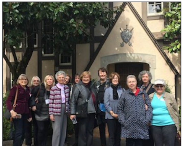
Mahonia Hall tour ↑

Willamette Valley Vineyard —An on-your-own tour.